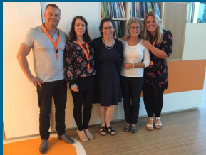
IWSA at the Princess Maxima Pediatric Oncology Center, Netherlands