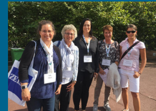
IWSA at the 4th European Aniridia Conference, Paris