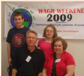
The Cox Family